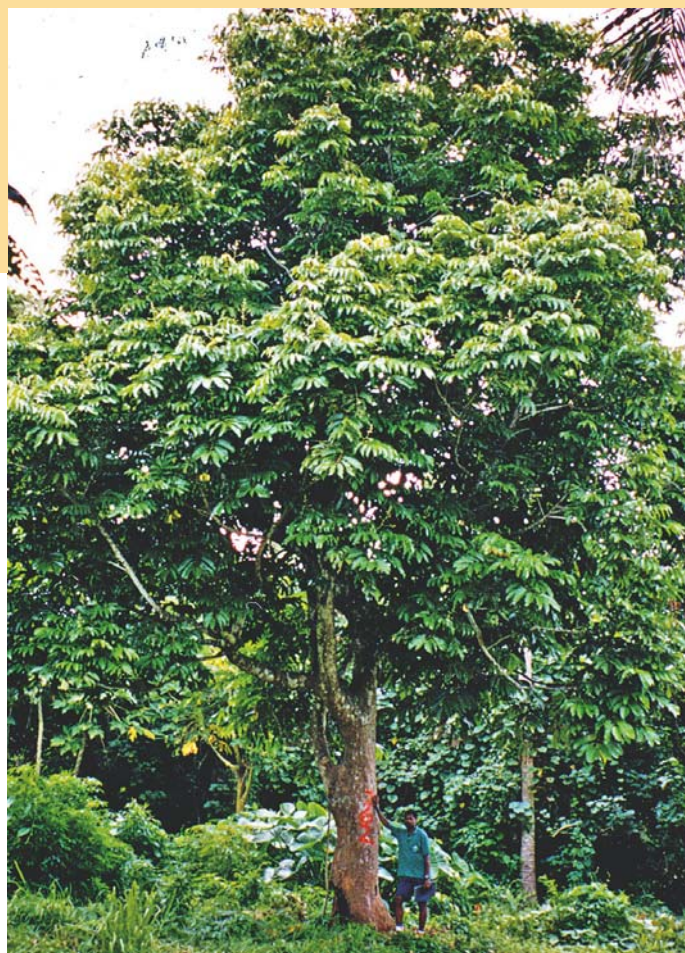
Canarium indicum , a commonly cultivated tree of the Pacific