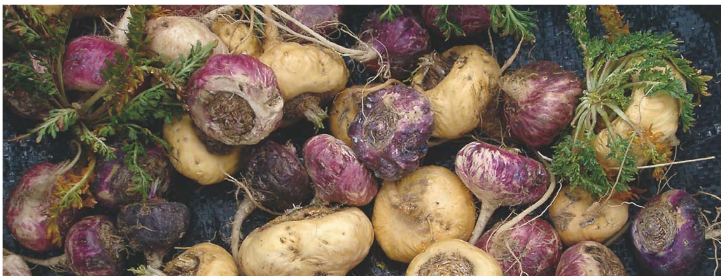
Maca ( Lepidium meyenii), a native Andean crop

These recommendations are currently being scrutinized from a legal point of view by BMVEL, the competent national authority for the implementation of the regulation in Germany, and will be fed into the EU-working group on Novel Food currently reviewing the regulation.